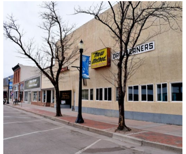
Photo: The New Method Laundry facility in Downtown Cañon City

Join us for the closing plenary to hear the compelling and inspiring story of brownfields revitalization in Cañon City. Learn how Cañon City has implemented a City-wide brownfields program, working through a network of partnerships with the community, brownfields experts, and the private sector, to turn liabilities into assets. The presentation will reflect and refocus many learnings from the day, covering a wide variety of brownfields tools, the often intangible "ROI", how smaller communities can use brownfields to manage growth without a loss of identity, attracting investment, and more. For a healthy dose of inspiration in the dynamic realm of brownfields redevelopment, you won't want to miss this presentation!